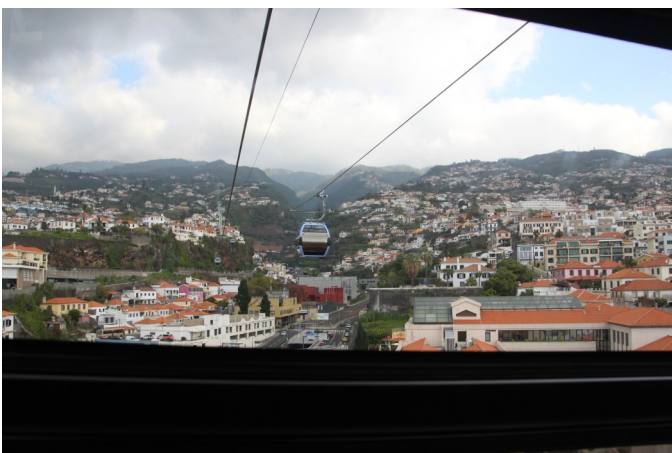
View from Cable Car in Funchal on the Island of Madeira