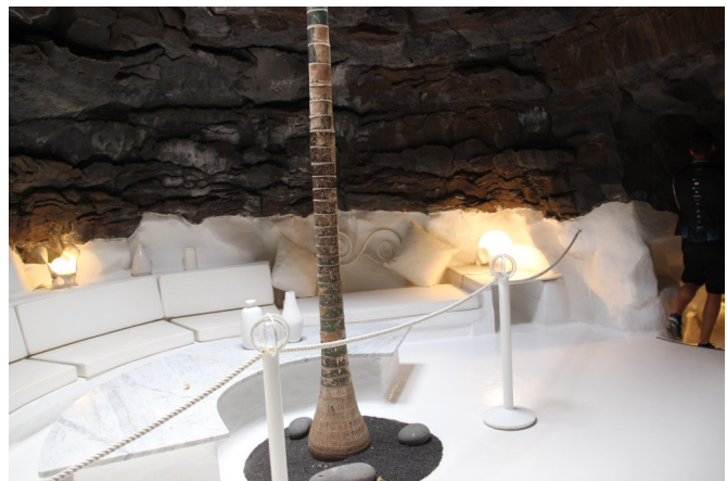
A room inside a volcanic bubble in the house built by Cesar Manrique' on the island of Lanzarote.