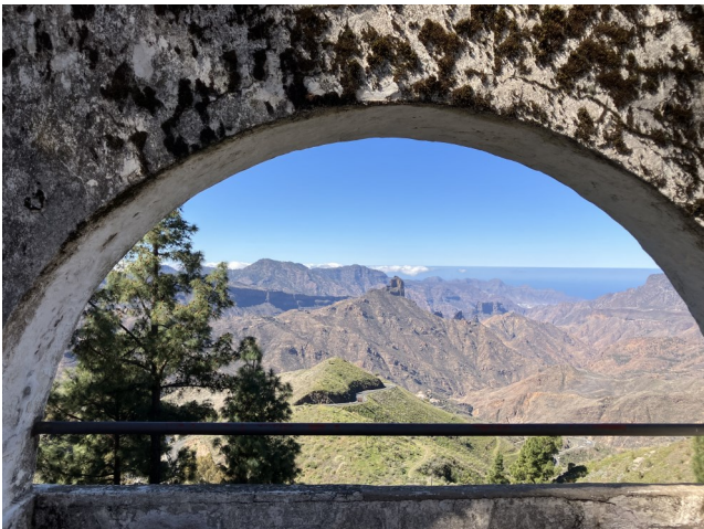
Caldara Tejada Canyon on Grand Canaria Island

This trip was an amazing experience. We learned about many cultures. The scenery was unusual and breathtaking on the Canary Islands and in Western Africa. (See more pictures on the website edition.)