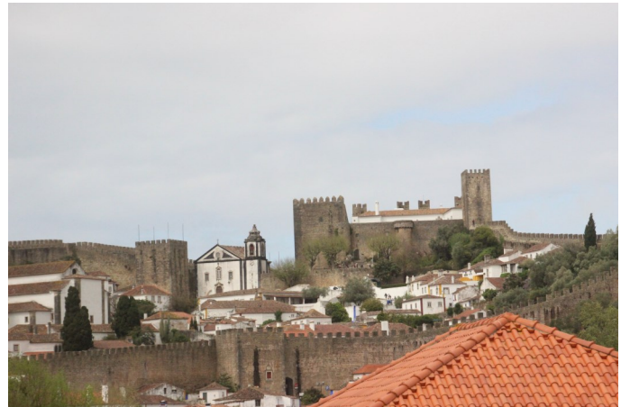
Obidos, Portugal—a medieval walled city in Portugal