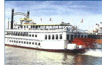
Enjoy a Riverboat Cruise