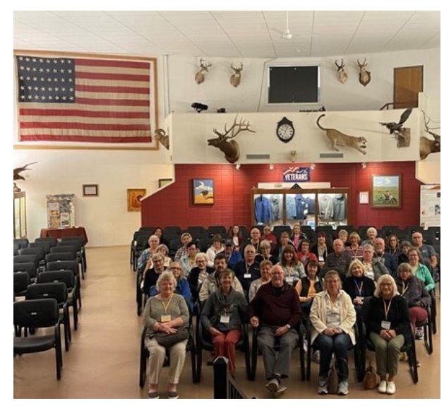
Finally !!! The RC 12 TRIP to South Dakota