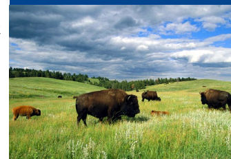
Wildlife enhances the pristine Black Hills

Departure: Our Lady of Mount Carmel, 39 St. Johns St, Amsterdam, NY @ 8 am