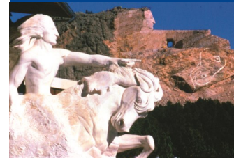
Crazy Horse Monument to be 10x the size of Mt. Rushmore