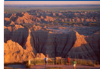
Spectacular Badlands National Park