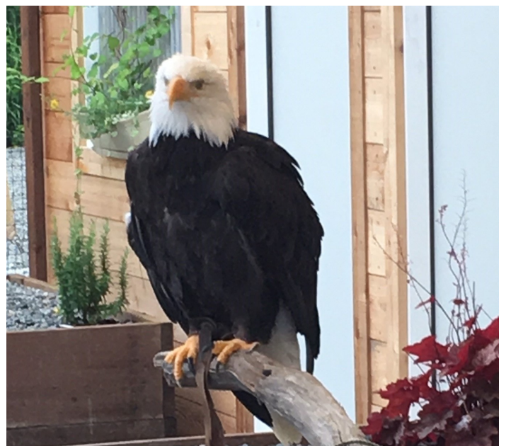
Bald Eagle at Rehab Center