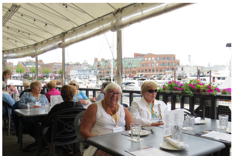
RC 12 Dining at Millio's Restaurant in Portland Maine

August 7-26, 2018 RC 12 trip to Alaska & Yukon Land and Cruise--Overnight Trip