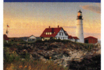
See the Portland Head Lighthouse

Departure: Mt. Carmel Church, 39 St. Johns St, Amsterdam, NY @ 8 am