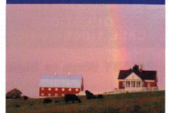
Visit the picturesque Pineland Farms