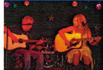
Nashville Nightlife Dinner Theater.