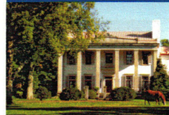
Belle Meade Plantation.