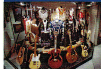
Country Music Hall of Fame.