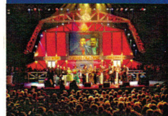
Famous Grand Ole Opry.