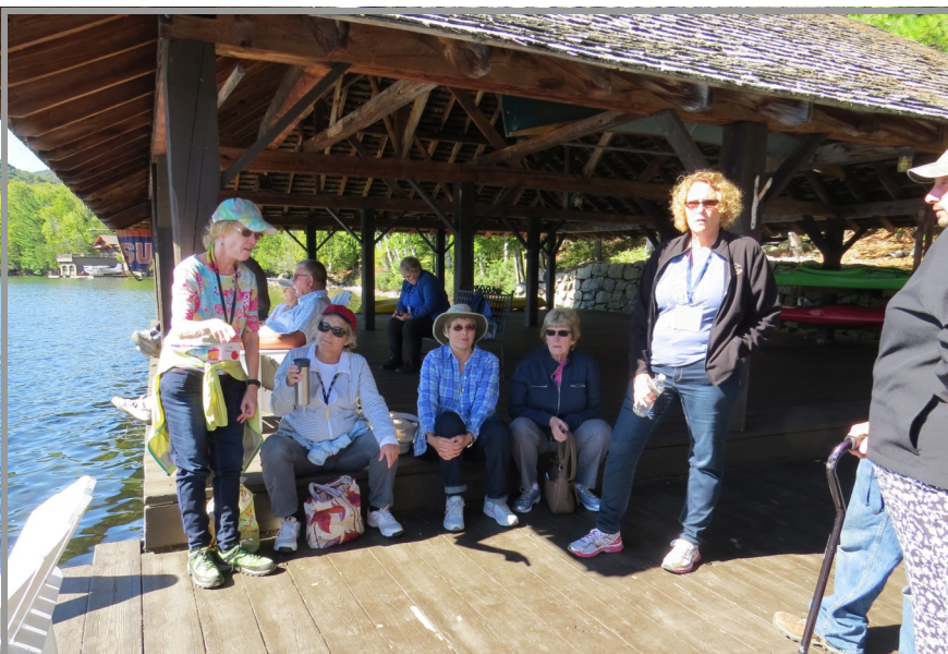
RC 12 members wait on the Minnowbrook dock for the boat tour of Blue Mountain, Eagle and Utowana Lakes.