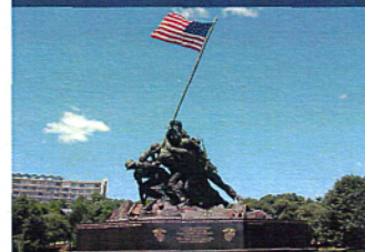
Iwo Jima Monument

Departure: Mt. Carmel Church, 39 St. Johns St, Amsterdam, NY @ 8 am