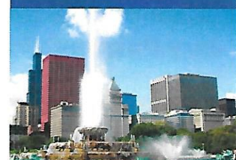
Guided Tour of Chicago

Day 7: Today after enjoying a Continental Breakfast, you depart for home... a time to chat with your friends about all the fun things you've done, the great sights you've seen and where your next group trip will take you!