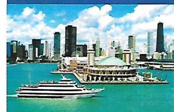
Enjoy a cruise on beautiful Lake Michigan