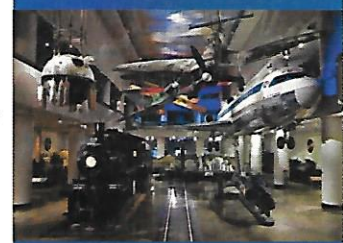
Explore the Museum of Science and Industry